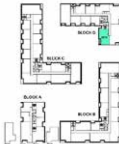
LEVEL 02 - 06