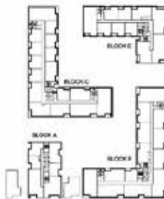
LEVEL 02 - 06