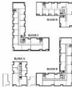
LEVEL 02 - 06