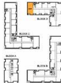
LEVEL 02 - 06