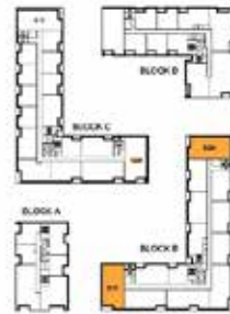
LEVEL 02 - 06