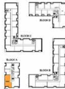
LEVEL 02 - 06