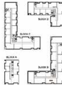
LEVEL 02 - 06